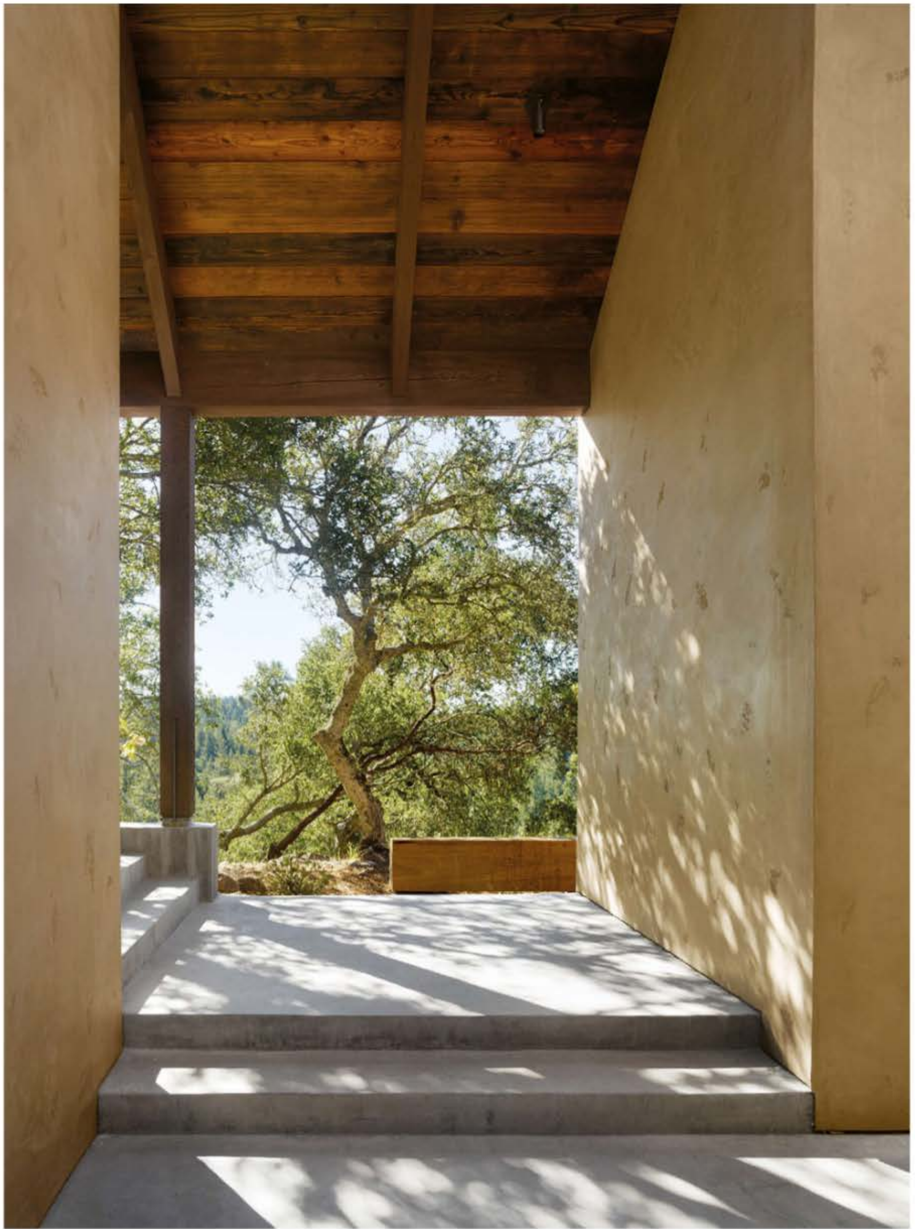
Trees dotting the property cast shadows on the plaster walls while concrete floors, fabricated by SLF Concrete Construction, flow from the inside out. Wine Country Plastering completed the home's plasterwork.