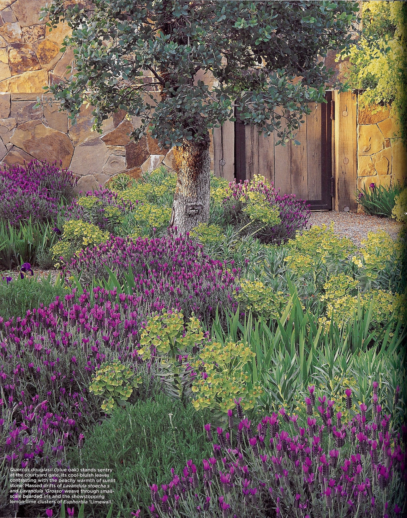
Quercus douglasii (blue oak) stands sentry at the courtyard gate, its cool-bluish leaves contrasting with the peachy warmth of sunlit stone. Massed drifts of Lavandula stoechas and Lavandula 'Grosso' weave through small-scale bearded irises and the showstopping lemon-lime clusters of Euphorbia 'Limewall' .